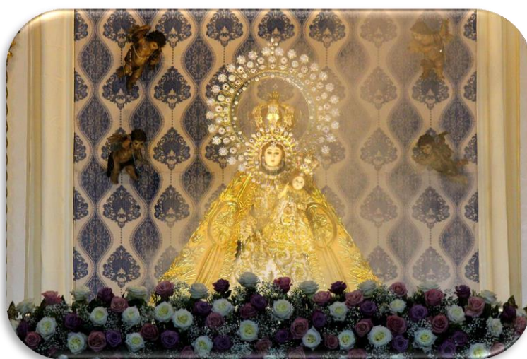
The image of Our Lady of the Holy Rosary of La Naval

This year also marks the 50th year since La Naval de Manila became the patroness of the city.