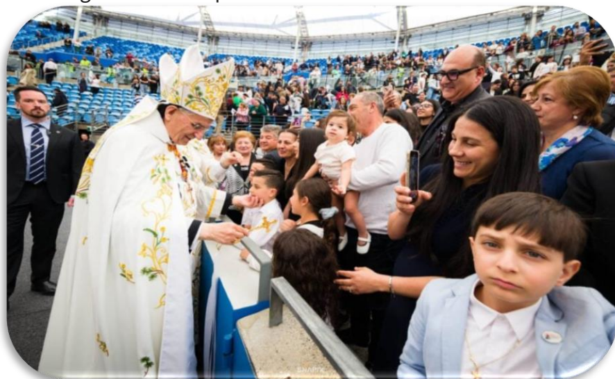
10,000 Maronites joined their patriarch for the high point of the year's Golden Jubilee celebrations.

In his homily, delivered in Arabic, the Patriarch thanked the Maronite Eparchy for its support of Lebanon in its present suffering through financial, medical and food donations as well as through social enterprises.